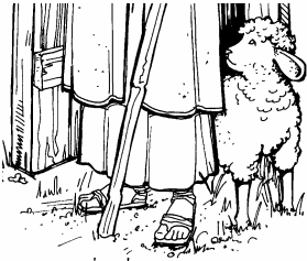
El pastor llama a sus ovejas por su nombre